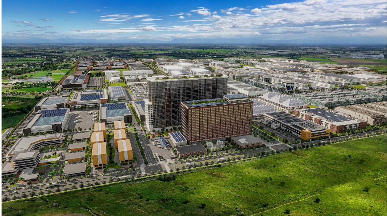
Artist's rendering of TARI Estate in Tarlac, an expansive 200-hectare development expected to generate 60,000 jobs.